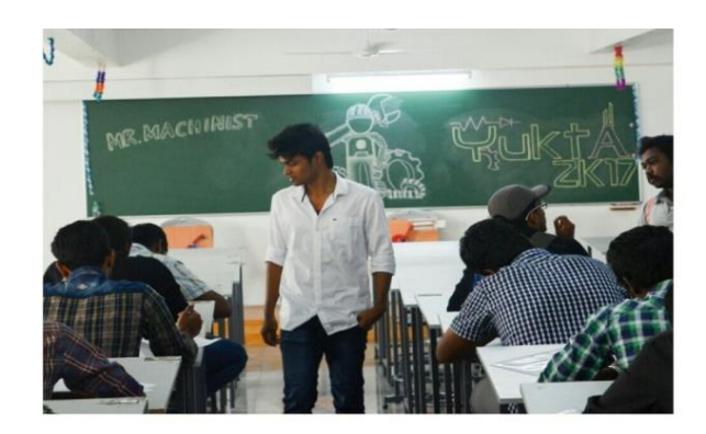
Fig 7: "Mr Machinist" Event was conducted on Yukta: 2017 held on 17th February 2017