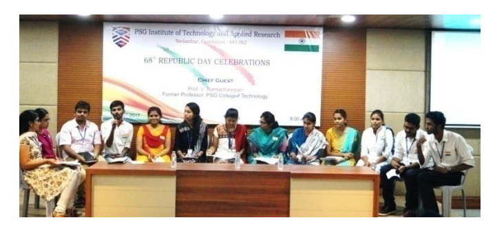
Fig 3: iTech Students participating in a cultural event iVision-2017 on Republic day function held on 26^{\rm th} January 2017